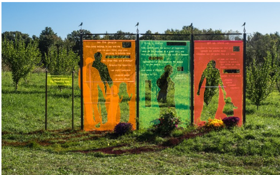
Eileen Donelan captured the colorful and meaningful "Easthampton's Big Beautiful Wall" at Park Hill Orchard.

For the presentation, we will be concentrating on the basic tools used most often. Higher-level tools like filters and plug-ins will be addressed at a future program. There may be some similarities in the workflow, but there are many different ways to achieve great results. There will be time for questions and answers after each demonstration.