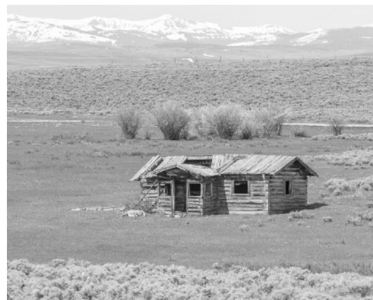
In "Sad Old Ranch House," above, Joyce Doty captured a sense of desolation and Kevin Fay conveyed serenity in "The Chinese Monastery," left. Exhibition results on pages 4, 5.