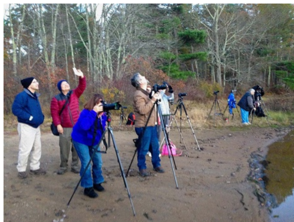
Photographers aim their cameras at the sky alongside Holland Pond.

The members said they anticipate returning to Holland Pond in May to photograph the Milky Way again. For those interested in finding other good locations to capture the Milky Way, Larry recommends darksitefinder.com ( http://darksitefinder.com/maps/world.html ).