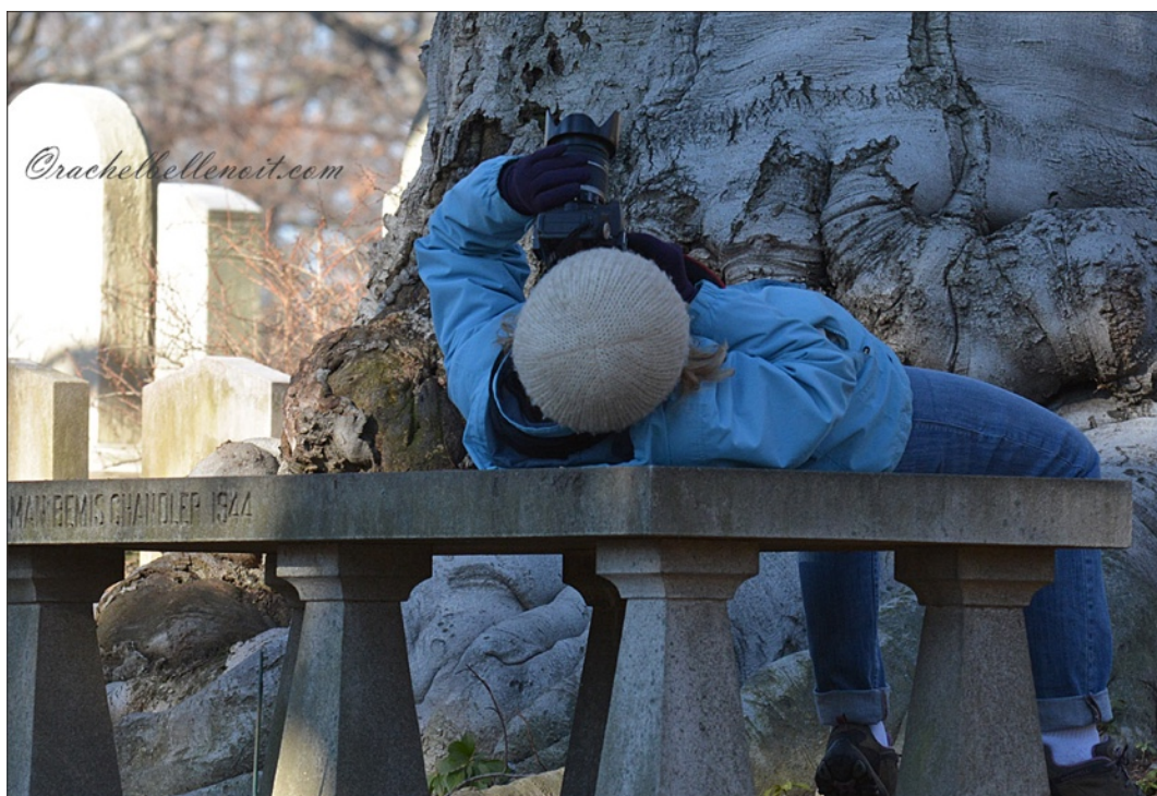
Barbara Krawczyk, above, lies back on a granite bench to shoot up from the trunk of a massive tree in Mt. Auburn Cemetery.

Those who attended concurred that a weekday return trip should be planned in spring, when trees and flowers awaken and the bird migration is under way. If anyone would like to lead the trip, please contact me at Bellenoit.rachel@gmail.com so I can provide all the details of the first excursion.