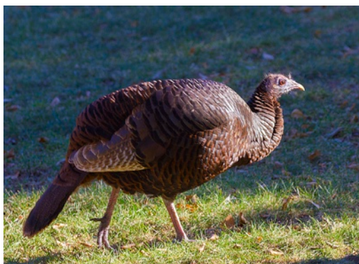
A wild turkey, above, roams the cemetery grounds and a monument, right, sits atop a hill.