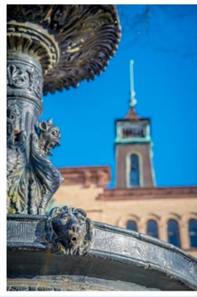
F-stop: f/6.3 Shutter: 1/2000 sec ISO: 640 Focal Length: 95mm