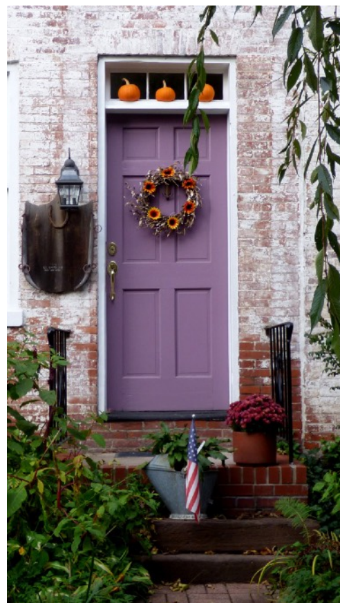
The Chester Bulkley House in Historic Wethersfield, CT