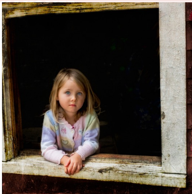
"Child in the Window" at Old Sturbridge Village, SPS Judges Choice Award, 2014-15.

Fine Art: http://fred-leblanc.artistwebsites.com/