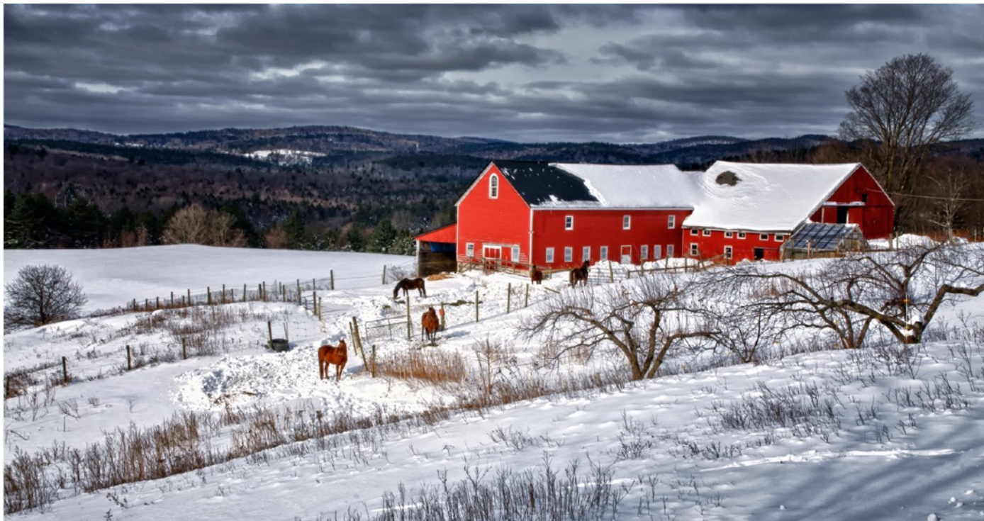
"Red Barn" in Conway, MA.