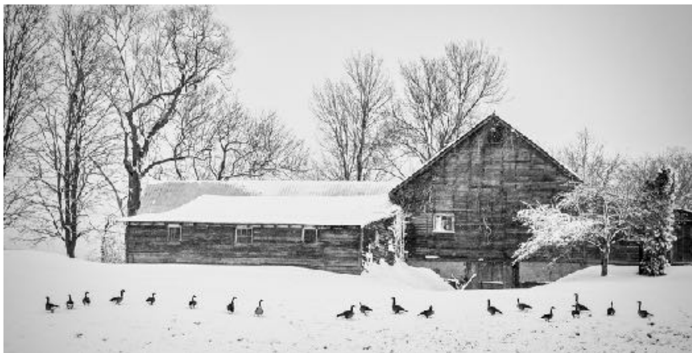
“Geese in a Row,” a black and white image by Jim Gillen, shows geese looking for food on a snowy farm field in East Longmeadow. It was an April exhibition entry in the B&W category.