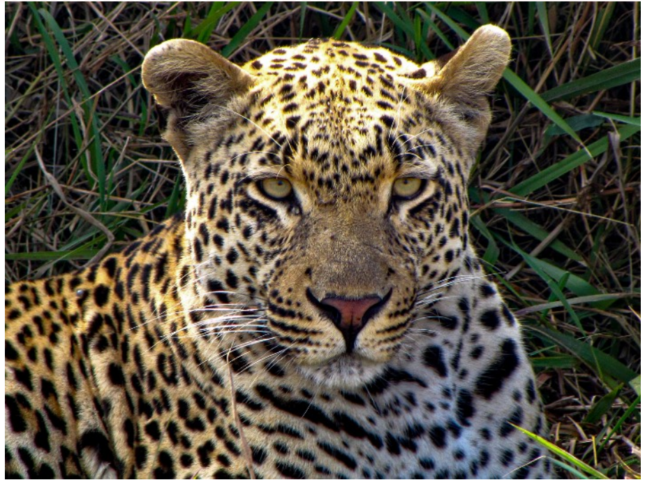
"Leopard in Africa," above, and "Giraffe in Botswana," below, are among photos Pete Nadeau shot while on safari in Africa.