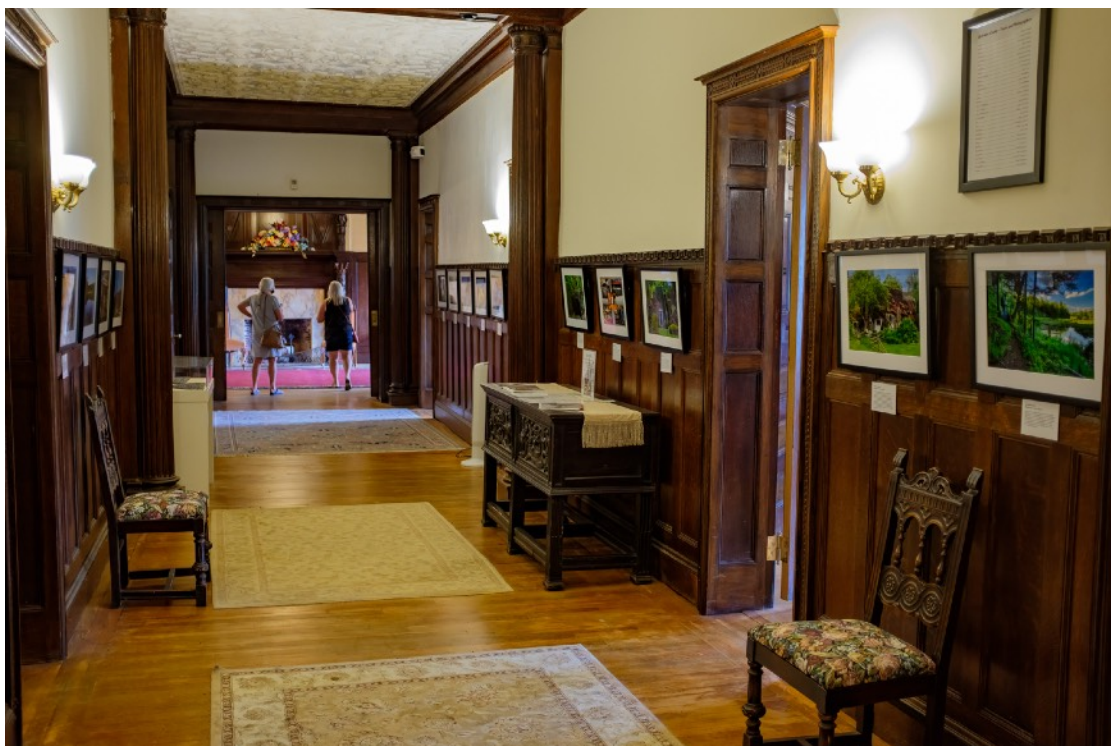
The Berkshire towns photo exhibit graces the walls at Ventfort Hall Mansion and Gilded Age Museum in Lenox. The show closes at the end of September and will go on display at Baystate Medical Center in Springfield in November and the Palmer library in June 2023.